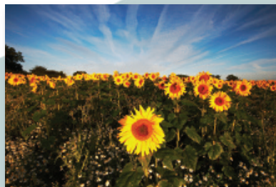
Above: Sunflowers and daisies – Sunflower crops are becoming more common in Norfolk.