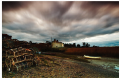
A rainy winter's day at Breckwater, Suffolk.