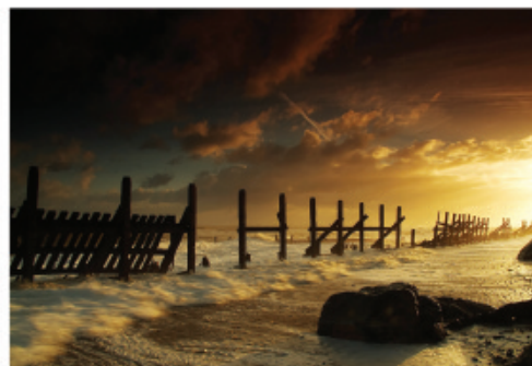
The old sea defences at Happisburgh in the early morning light.