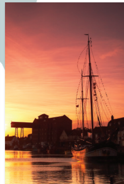
Starlings and flags in the rigging of the "Albatross" silhouetted against the dawn at Wells-next-the-Sea.