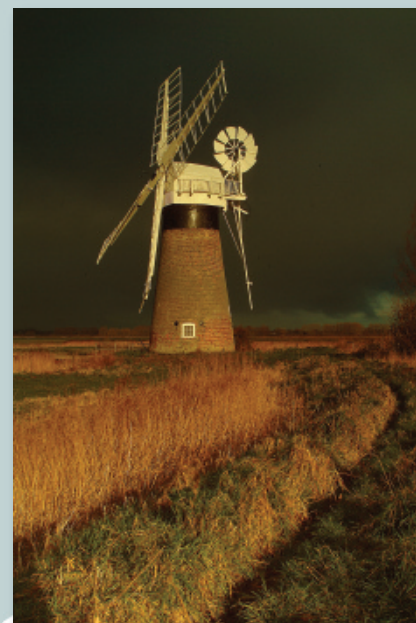
The warm morning light catches St Benet's Level mill before the storm arrives.