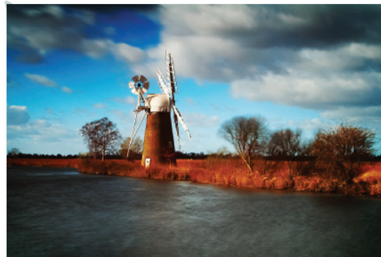
A sunny but breezy February day at Turf Fen.