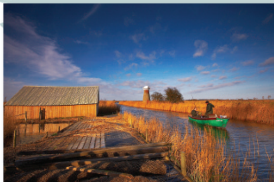
Left: Returning after a day's fishing past the boat house at West Somerton.